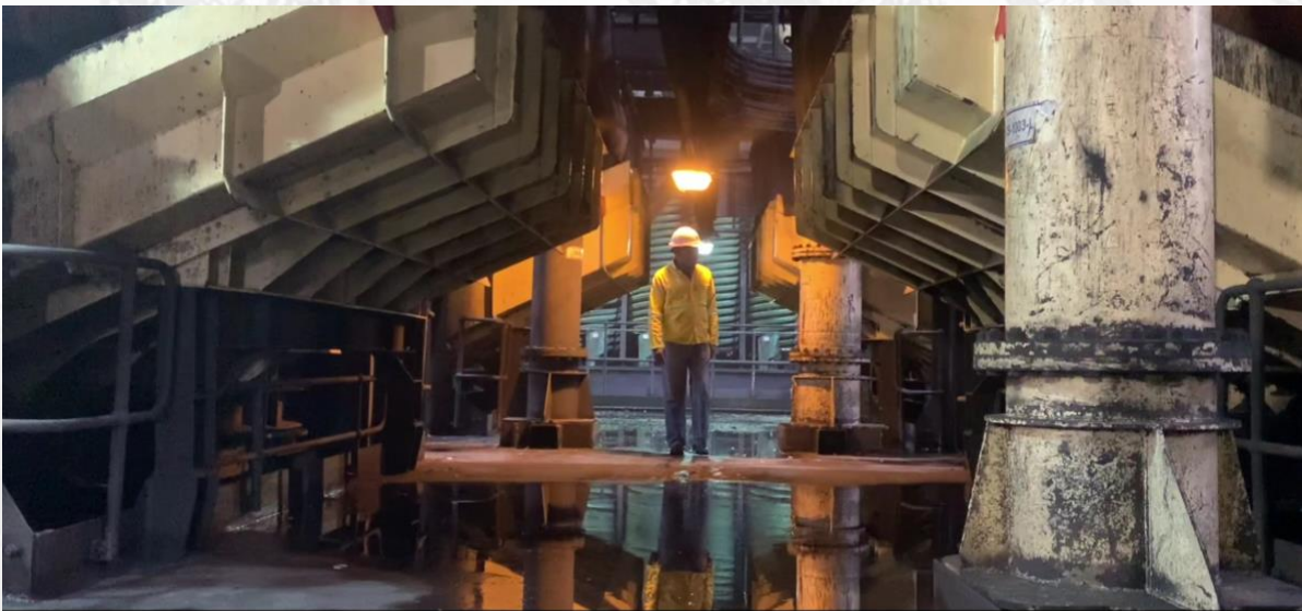
At the end of the day it's about when you're on your own, alone